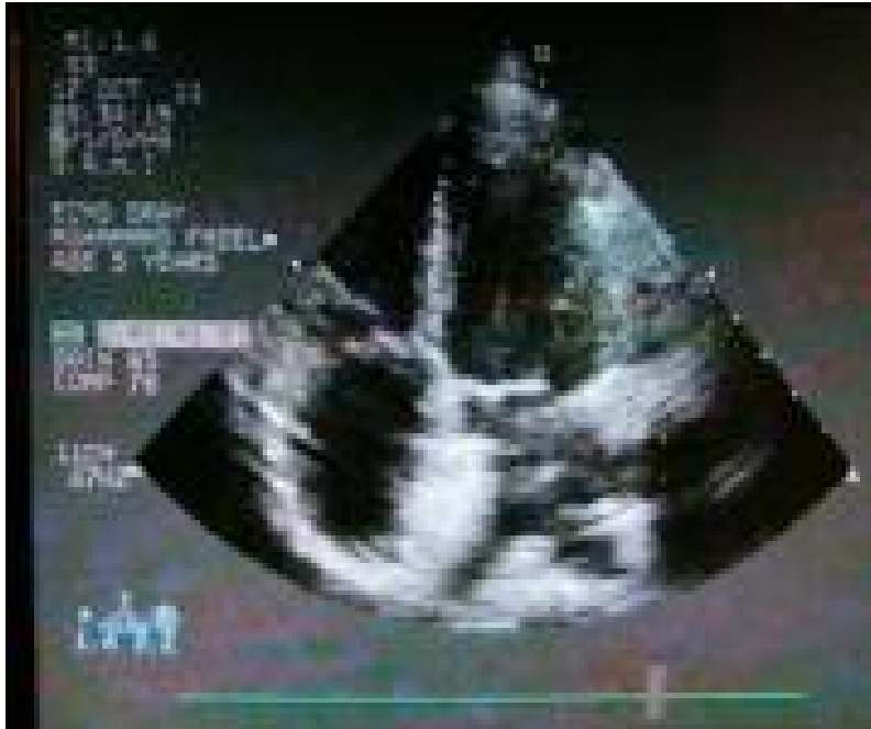
Fig.3: Trans-Esophageal Echocardiogram. Four chamber view shows the device occluding the ASD.