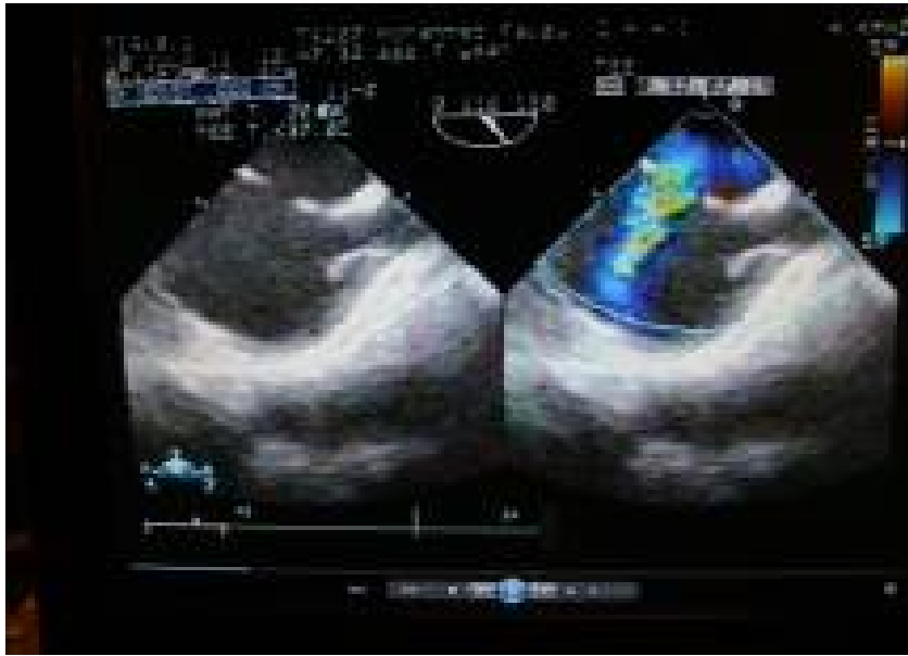
Fig.2.a: Trans-Esophageal Echocardiogram . Bicaval view with and without colour shows the ASD