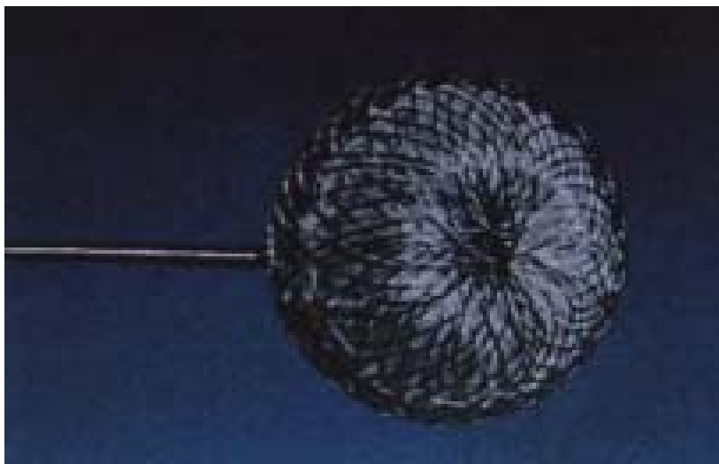
Fig.1b: The Occlutech Figulla device .The device attached to the delivery cable. Note the absence of the microscREW in the left atrial disc.