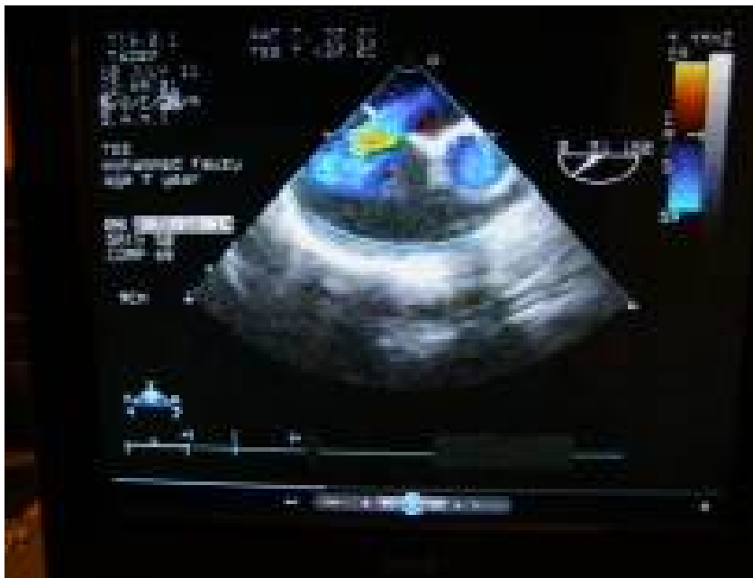
Fig.2.b: Trans-Esophageal Echocardiogram. Coloured short axis view shows the ASD